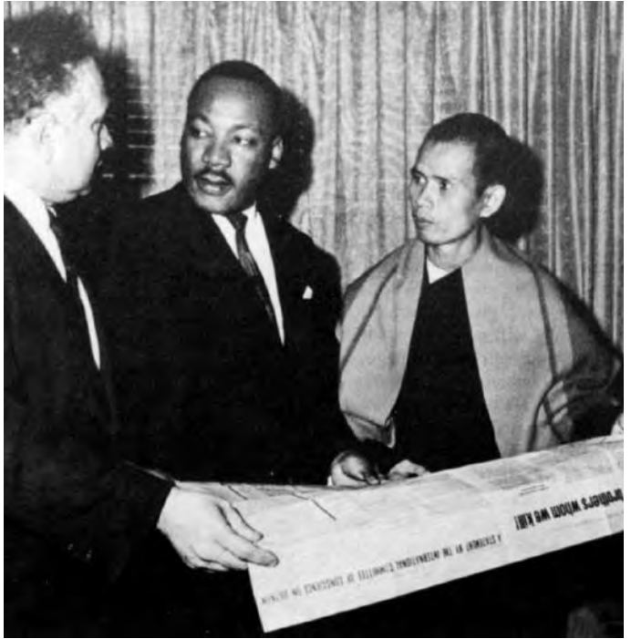
Martin Luther King Jr. and Thich Nhat Hanh were among the distinguished signatories of the statement of the International Committee of Conscience in Vietnam. King nominated Nhat Hanh for the Nobel Peace Prize.